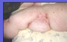
2 months later