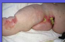
After 5 years of “Standard” Wound Care