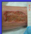
After 3 months of “Standard” Wound Care