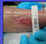
5 months later