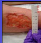
After 2 weeks using Pneumatic Medicine