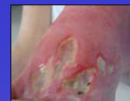
Before Pneumatic Medicine