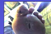
After 26 days of negative pressure therapy