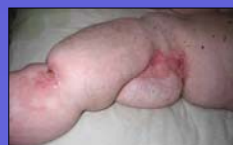
After 10 days using Pneumatic Medicine