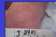
After 3 weeks using Pneumatic Medicine